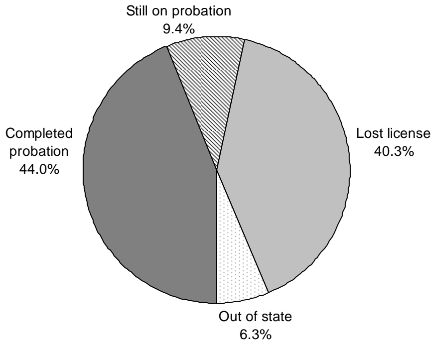
Chart 2. Outcomes of Probation for Chemical Dependency Probationers

Of the 89 chemical dependency probationers that did not complete probation, 66.3% failed the chemical dependency requirements, 38.2% failed the reports component, and 34.8% failed the mental health evaluation and treatment requirements of their probation, as shown in Table 11. Since almost all nurses with chemical dependency requirements of their probation were on probation for a drug or misconduct offense (93.3%), the reasons why these RNs failed probation are not categorized by the grounds for probation.